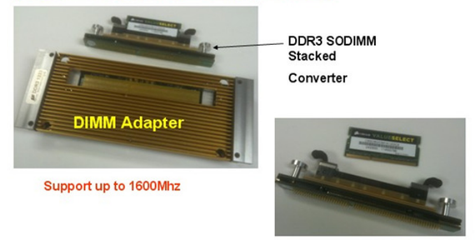
Converts : DDR3 240pin DIMM tester to 204pin SODIMM Adapter